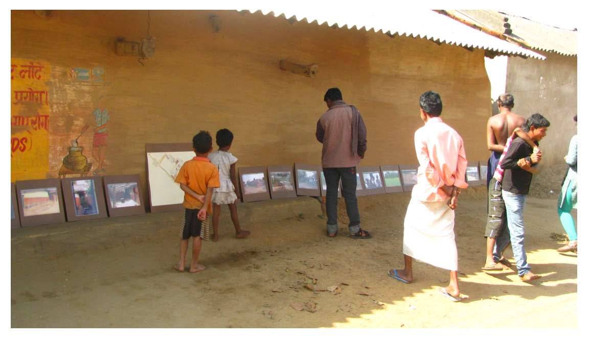
Fig.3: Public display of architectural photographs and drawings in villages as part of PhD fieldwork in March 2013.